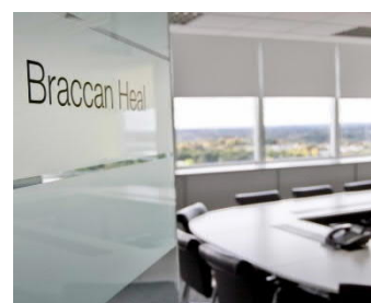
Course delivered virtually or at Ocean House, Bracknell

For those who wish to dig a little deeper, we bring in additional data tables and blend data from across sources. More advanced expressions are also built, using Set Analysis syntax.